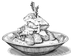
"Crazy Good Roasted Chicken Thighs"

*TBM = Crushed Tomatoes, Basil, aged Mozzarella (available by the slice)